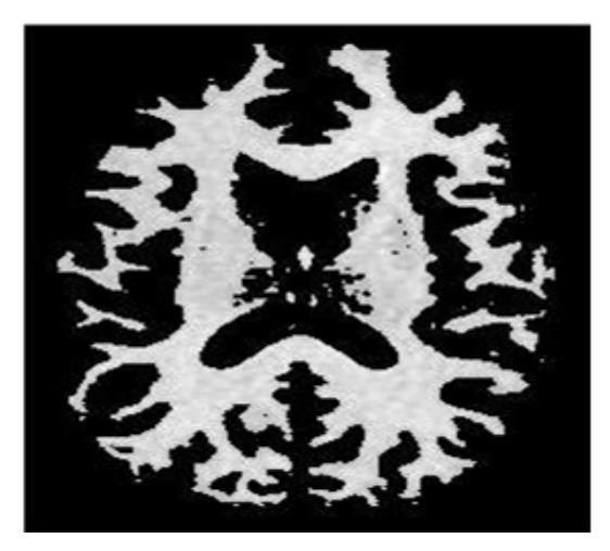
Figure 4 : Cluster 3