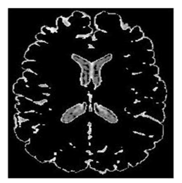
Figure 2 : Cluster 1