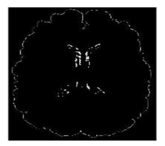
Figure 5 : Cluster 4