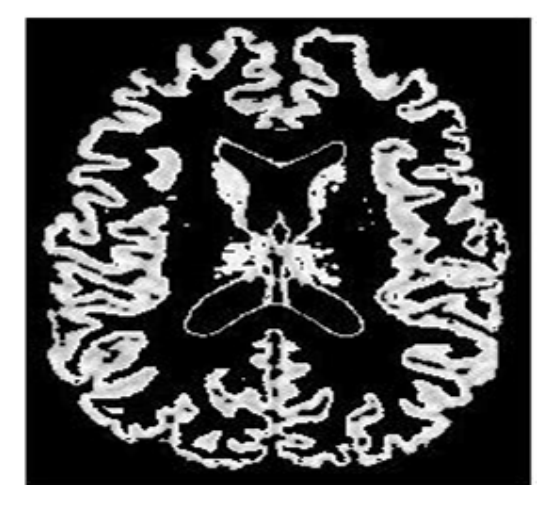
Figure 3 : Cluster 2